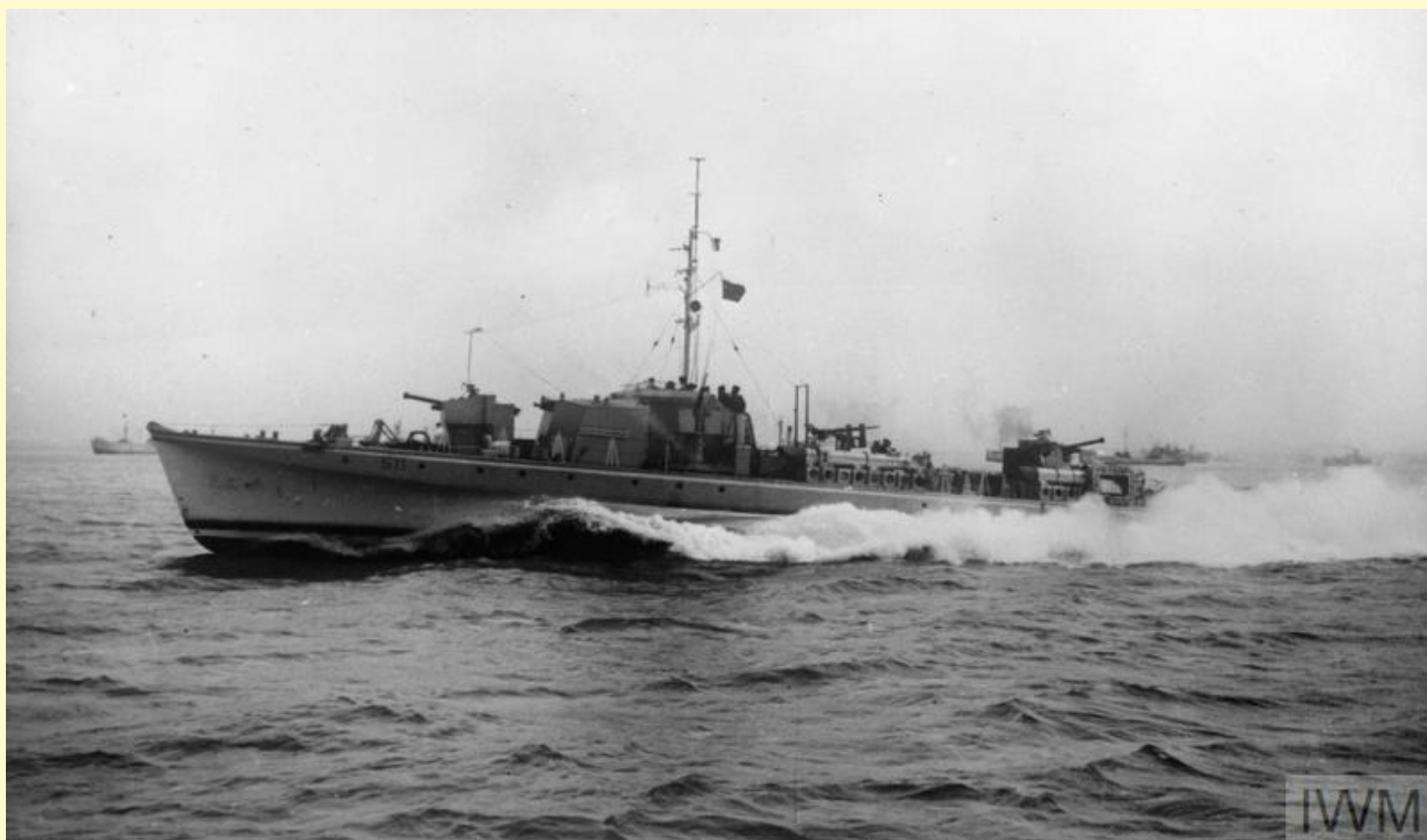
MGB 511